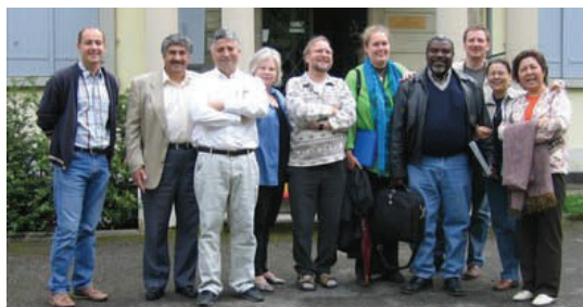
HURIDOCS Continuation Committee (CC) and secretariat staff

The HURIDOCS structure consists of: the General Assembly , the Continuation Committee (board), the International Advisory Council , the Secretariat as well as the large network of human rights organisations that use or contribute skills, tools and expertise.